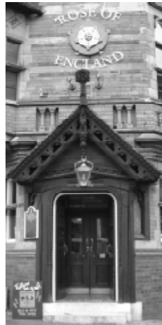
Rose of England

A new-comer to the Mild trail won first place for the Best Display; who could miss those dancing feet leading you to the Mild pump on the bar at the Rose of England . Second place went to the Horse & Groom , Basford, who featured their forthcoming Mild ales.