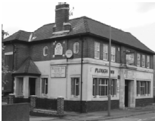
The Plough, Radford

There is an impressive range of Light and Dark Milds to be savoured, produced by breweries from all over the country. There are several brewed locally including Hardys & Hansons Kimberley Mild. Nottingham Rock Mild is being distributed to over 26 pubs locally during May and is also reaching further afield. Castle Rock Black Gold is to be found throughout the Tynemill Estate and in other outlets. Other local microbreweries also produce Milds and these will be found around the region during May. See how many different ones you can find.