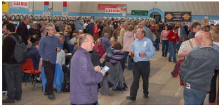
This years beer festival

So now it is time to plan for next years festival to be held from Thursday 19 th October till Sunday 22 nd October.